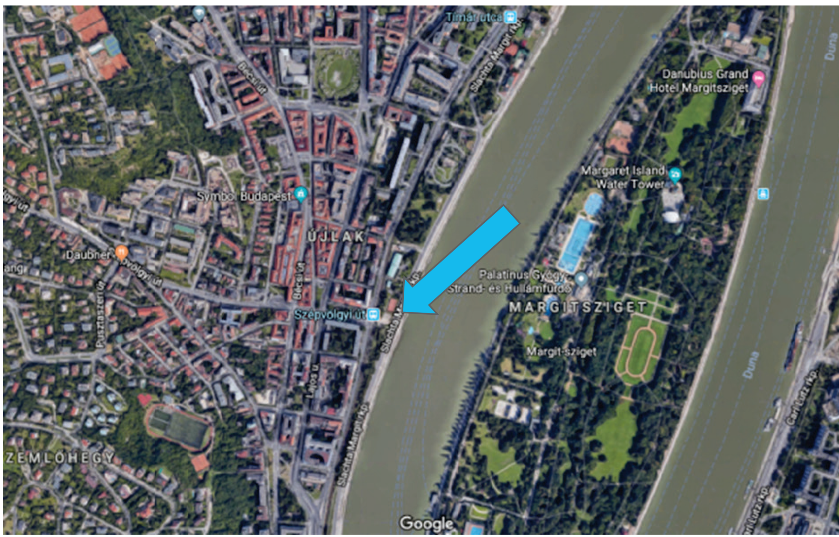
Figure 1. Pilot site location